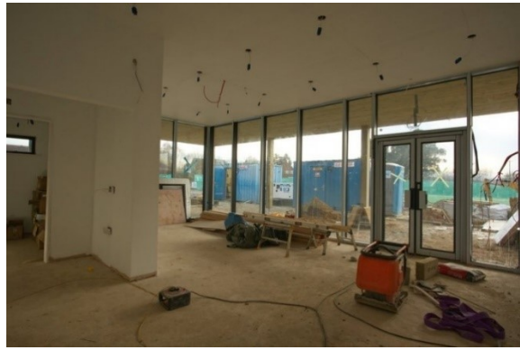
Matfield Village Hall (Tonbridge and Malling) - new ceiling with insulation